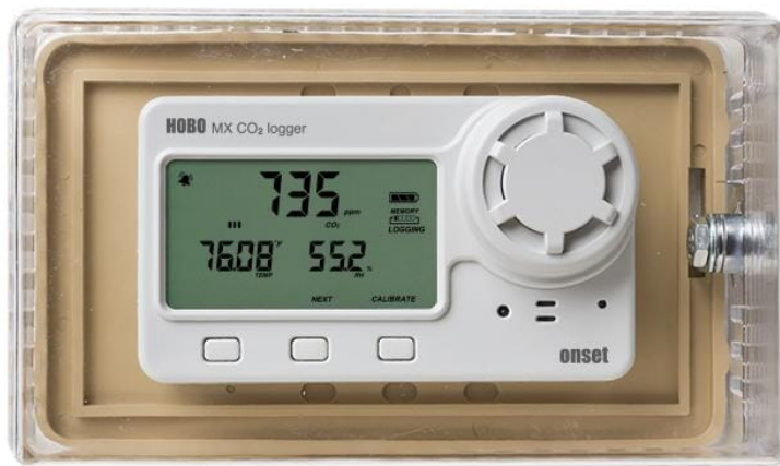
Data logger sold separately