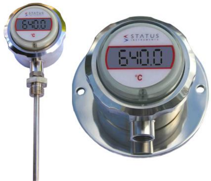
DM640 SHOWN IN A SCH15 ENCLOSURE